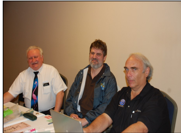
Three of the great tournament Directors ~ without whom there would be problems !